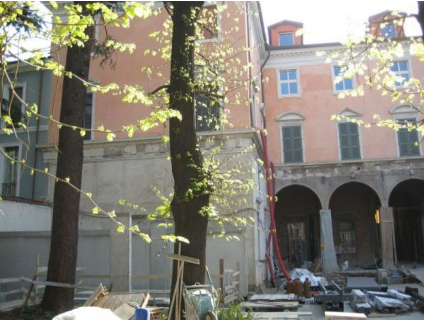
Palazzo Ferrazzi - Brescia